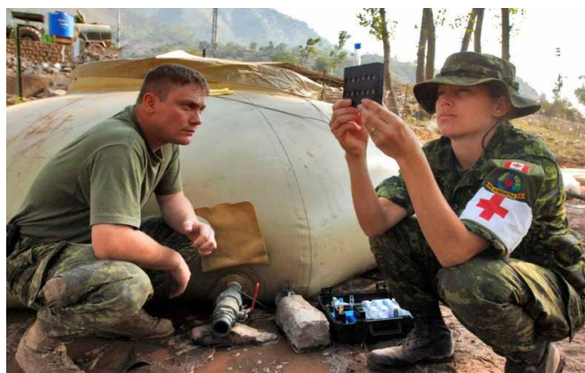
Canadian Armed Forces Preventive Medicine Technician testing water samples on deployment