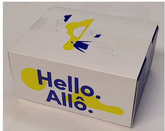
Fig. 1 GetaKit exterior

Anyone interested in self-testing could visit www.GetaKit.ca and complete a series of steps (Fig. 3). The first was the eligibility screener. Those deemed ineligible were diverted to