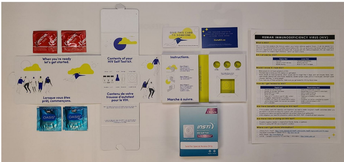
Fig. 2 GetaKit interior with contents